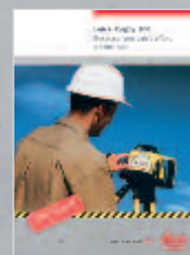
Leica Rugby 100 The tough construction laser