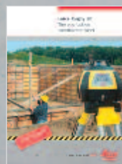
Leica Rugby 50 The one-button construction laser