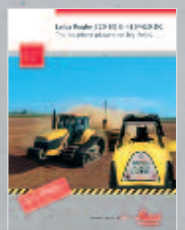
Leica Rugby 320SG & 410/420DG Single and dual grade construction lasers