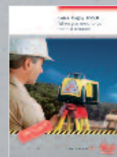
Leica Rugby 100LR The long range construction laser